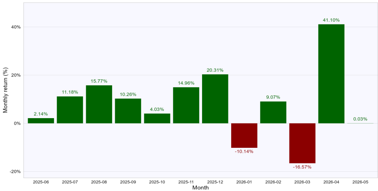
12 LAST MONTHS ROLLING RETURNS BeQ Vietnam VNX Family Business Index